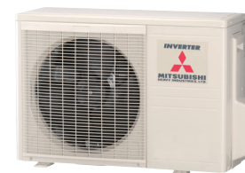
SRC20ZGX-S, SRC25ZGX-S SRC35ZGX-S